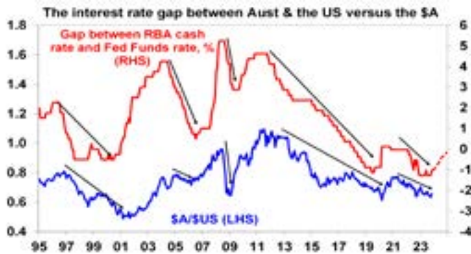
The dashed part of the rate gap line reflects money mkt expectations.